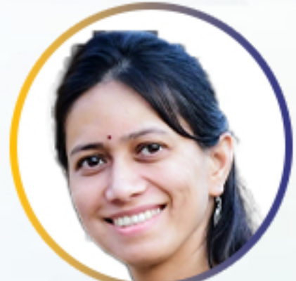
Dr Sima Das Shroff Charitable Eye Hospital New Delhi